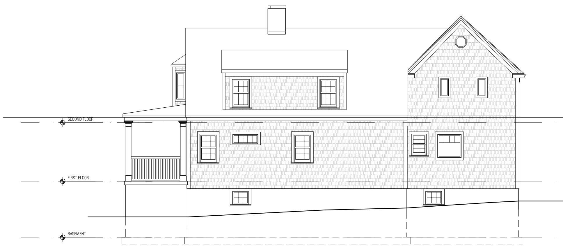
3 EXISTING WEST ELEVATION SCALE 1/4" = 1'-0"