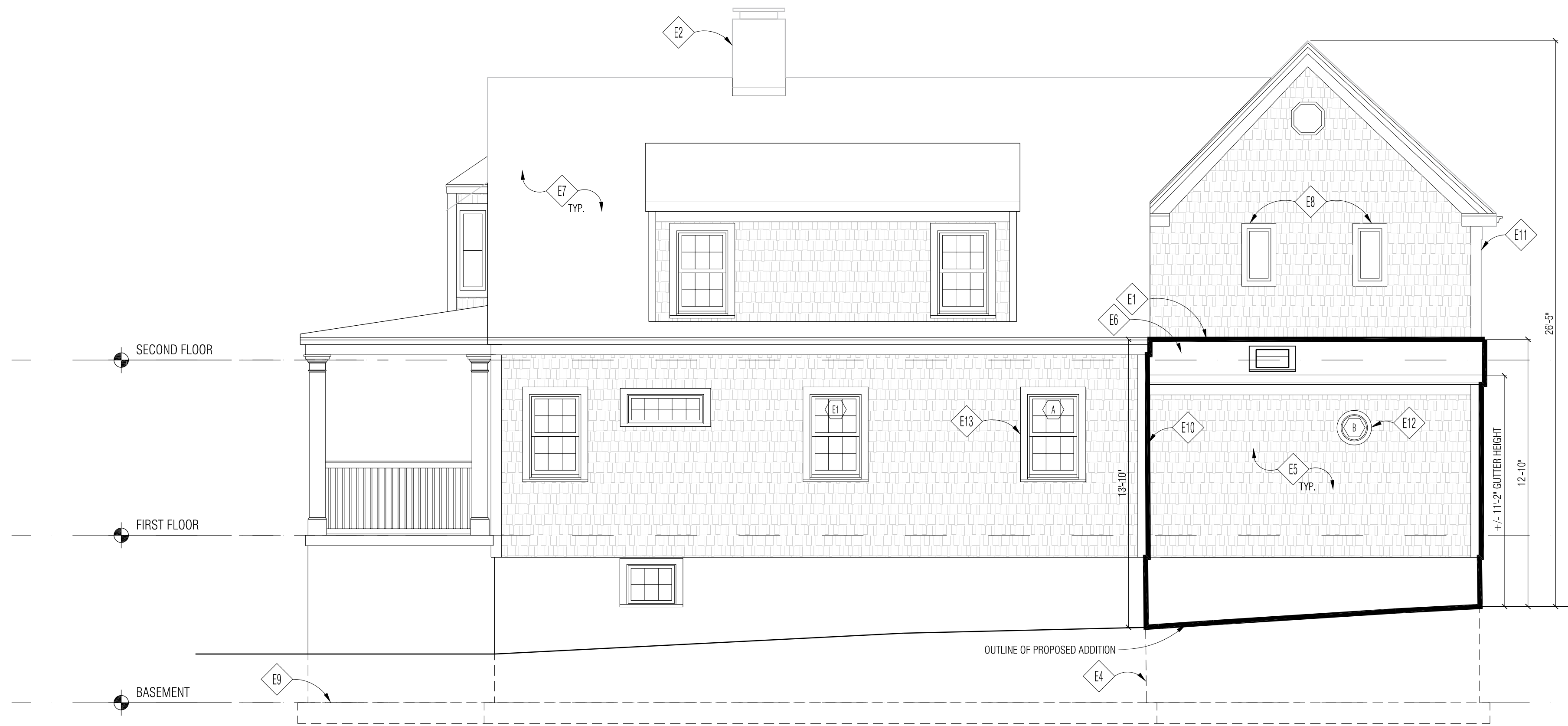
4 PROPOSED WEST ELEVATION SCALE 1/4" = 1'-0"