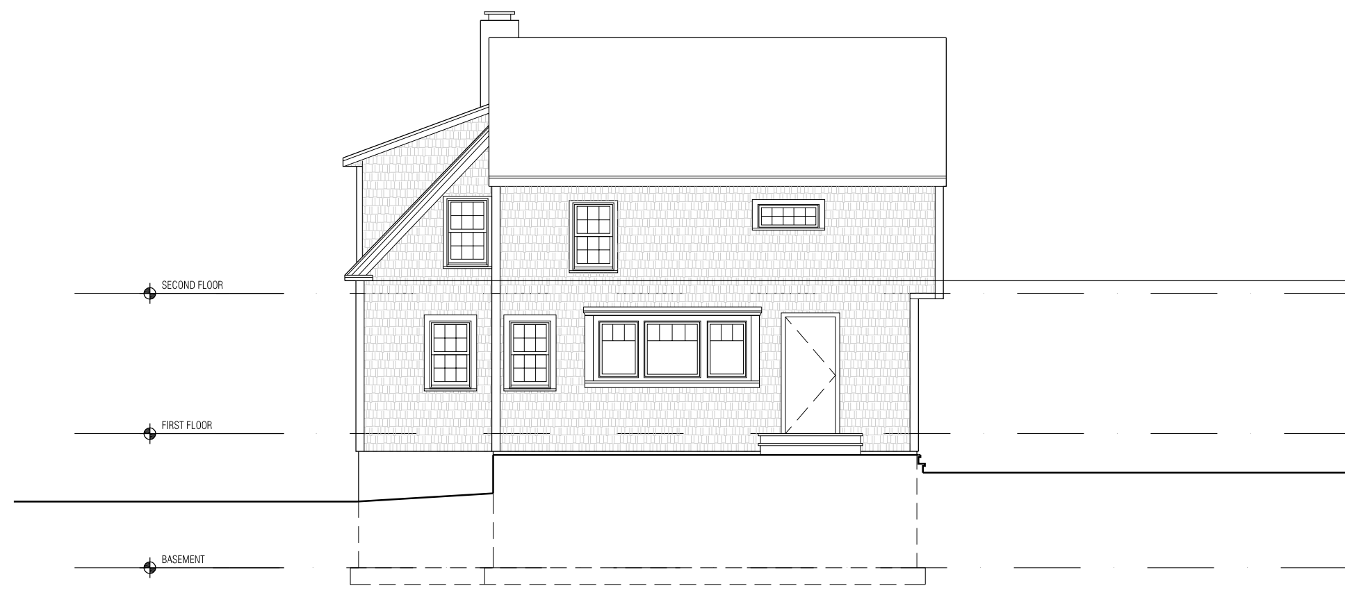
1 EXISTING SOUTH ELEVATION SCALE 1/4" = 1'-0"