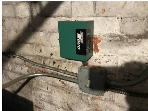
Boiler Pump Relay