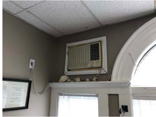
Window AC Units