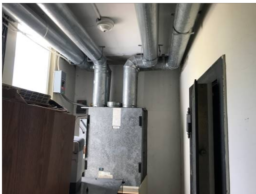
Thru-Wall AC Unit

The Addition basement and first floor Vault rooms air conditioned by (2) split system air handling unit with associated supply and return ductwork and in-duct electric steam generating humidifier. The indoor units are connected with refrigeration piping to (2) outdoor grade mounted condensing units that are located adjacent to the Chiller. The basement vault AC unit was manufactured by Bryant, and has an associated 1.5 Ton outdoor R-22 air cooled condensing unit that was manufactured by Ameristar (Model PA13NR018). The indoor and outdoor units appear to be in good physical condition. Some sections of the vault ductwork insulation appear to be damaged and in need of repair or replacement. The first floor vault AC system indoor and outdoor units are believed to have been installed in 1988. The outdoor unit appears to be in poor condition.