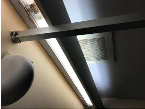
Toilet Room - Ceiling Exhaust Fan

Cohasset Town Hall Cohasset, MA HVAC Existing Conditions Systems Report J#732 006 00.00 L#56566/Page 7/May 23, 2017