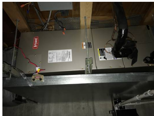
Basement Vault AC Unit