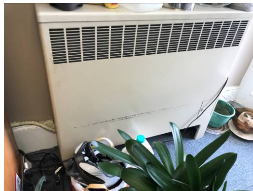
Original Building Convector Radio