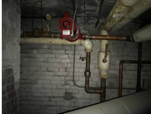
Dual Temperature Pump

Cohasset Town Hall Cohasset, MA HVAC Existing Conditions Systems Report J#732 006 00.00 L#56566/Page 4/May 23, 2017