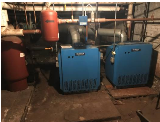
Existing Hot Water Boilers, Expansion Tank & Air System

There are two in-line hot water pumps installed in the basement boiler room. One pump serves the original Town Hall building's heating system and the other pump serves the Addition building's dual temperature heating and cooling system. The addition building pump was manufactured by Bell& Gossett and appears to be in good condition, while the original building hot water pump was manufactured by Taco, and appears to be in poor condition. Neither of the pumps are equipped with VFD (variable frequency drives) drives or ECM motors.