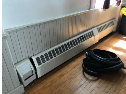
Auditorium Fin Tube Radiation