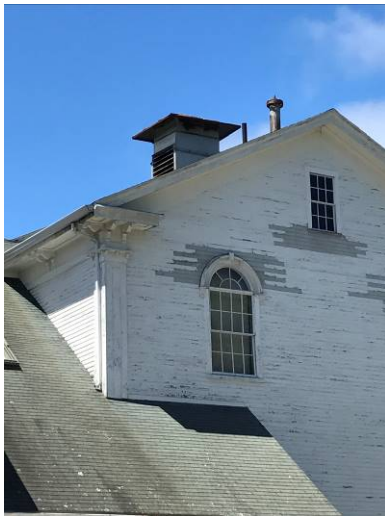
Original Town Hall Turbulator Exhaust (right) and Louver (left)

The original Town Hall building is primarily ventilated through the use of natural ventilation by use of operable windows and a whole building exhaust ventilation ductwork system. Several of the restrooms did not have mechanical ventilation systems installed. There is an exhaust turbulator system installed which appears to exhaust some rooms in the original building. However, this system appears to be in poor condition and in need of replacement and upgrades. The Auditorium dressing/storage room exhaust ventilation systems are not operable, and need replacement. The Auditorium does not appear to have a mechanical ventilation system installed.