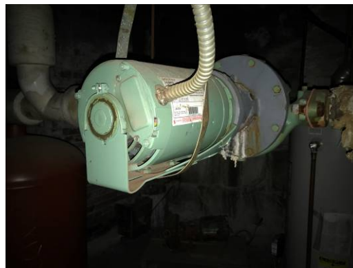
Hot Water Pump (Taco)