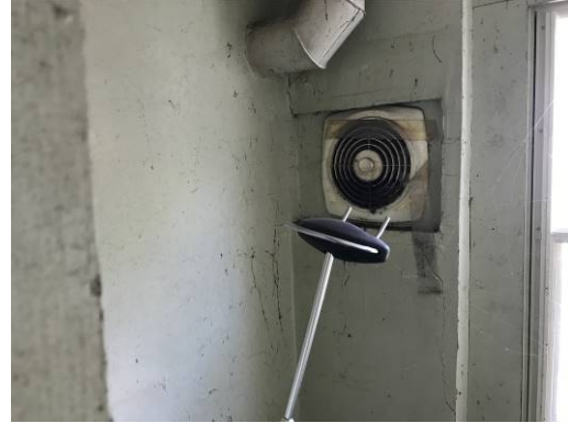
Auditorium – Dressing Room Exhaust Fan

The Addition building toilet rooms and janitor's closet are exhausted by ceiling mounted exhaust air fan systems. There is also an exhaust fan serving the interior of the second floor Collector/Treasurer office area. The exhaust fans appear to have been installed in 1988 and are in poor condition. The elevator machine room is ventilated by an exhaust air fan. The kitchen range hood fan is vented to the outdoors.