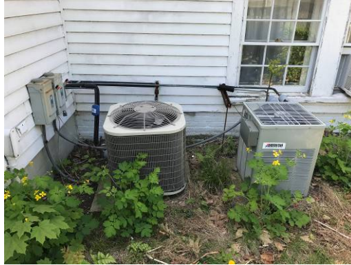
Air Cooled Condensing Units

Cohasset Town Hall Cohasset, MA HVAC Existing Conditions Systems Report J#732 006 00.00 L#56566/Page 6/May 23, 2017