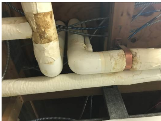
Damaged Dual Temp Piping Insulation

The two-pipe change over piping distribution system that serves the Addition building was installed circa 1988, and appears to be in fair condition. The piping is approximately 29 years old and nearing the end of its expected useful service life of 30 years. Many sections of piping insulation, particularly in the basement and Auditorium dressing room appears to be in poor conditions and showing signs of water damage from condensate occurring on the exterior surface of the piping and possible small pipe leaks which may have occurred in the past. Some piping hangers are also corroded due to direct contact with piping.