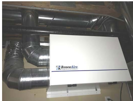
Meeting Room ERV Unit

The unit and associated ductwork distribution appears to have been installed in recent years, and appears to be in good condition.