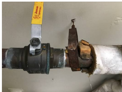
Chilled Water Piping Missing Insulation

The dual temperature system is changed over from heating to cooling by a set of manual change over valves that are located in the basement boiler room.