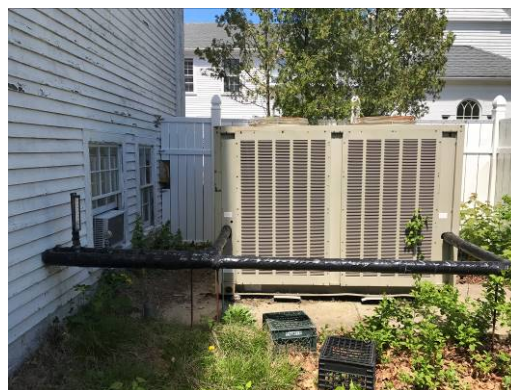
Outdoor Air Cooled Chiller

The Addition building is air primarily air conditioned by an outdoor grade mounted chiller that is located behind the building within a fence enclosure. The chiller was manufactured by Trane (model CGACC30, R-22 refrigerant) and has a nominal capacity of 20 tons. The Chiller was installed in 1988, is approximately 29 years old and is beyond its expected useful service life of 20-25 years. The chiller casing and fan guards are rusted in areas. Chilled water is distributed from the chiller to building fan coil units by a dual temperature in line pump that is connected to an insulated steel and copper insulated piping system.