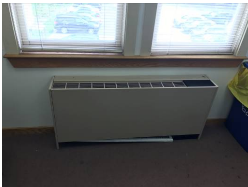
Addition Fan Coil Unit

The restrooms in the original and addition areas of the building are heated by a combination of hot water fin tube radiation and convector radiator heating equipment. The majority of this equipment is in poor physical condition.